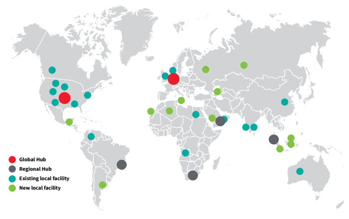
Comprehensive Aftermarket Products and Services