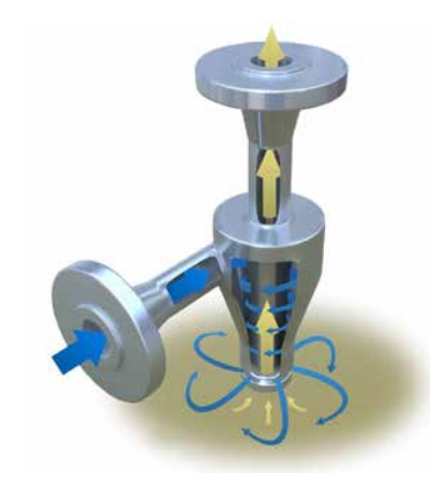
Figure: Tore fluidizer, used to remove solids from the ToreTrap vessel and upstream separators.